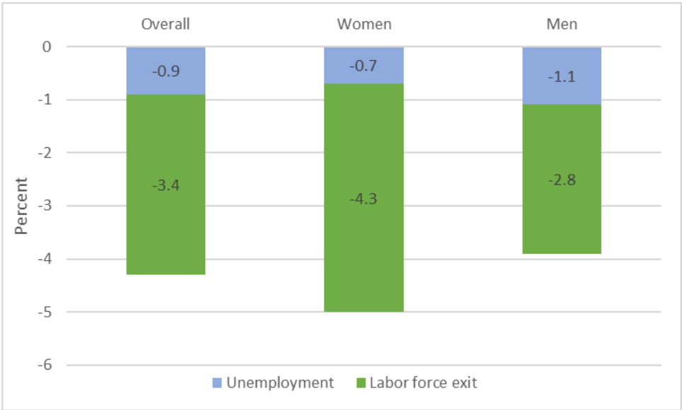
Figure 3. Decomposition of Global Employment Losses, 2020 (in percent)

increased need for childcare and home-schooling during the pandemic. Globally in 2020, women experienced an average 5.0 percent reduction in employment compared to 3.9 percent for men. A decomposition analysis in ILO (2021) indicates that women’s withdrawal from the labour force accounts for most (4.3 percentage points) of their employment reduction. In contrast, men were more likely to be officially unemployed (and searching for a job) as opposed to dropping out of the labour force (Figure 3).